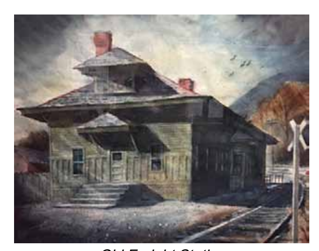
Old Freight Station

Her works captured beautiful scenes and moments in time.