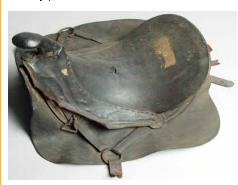
Artifacts like this saddle require specific humidity and temperature levels to prevent further deterioration

The majority of artifacts in a museum collection are made of natural organic materials. If the humidity (a measure of the amount of moisture in the air relative to the amount the air is capable of