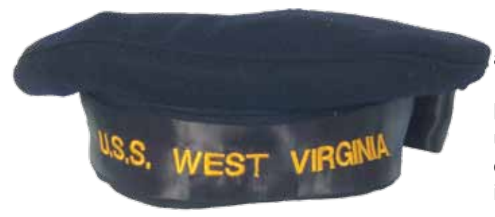
Sailor's cap from the USS West Virginia

The West Virginia State Museum is proud to honor the legacy of the USS West Virginia and the fine sailors who served on her. Nicknamed "WeeVee" by her crew, she was the last battleship built before World War II and was commissioned December 1, 1923. The USS West Virginia served as the flagship of the battle fleets. "WeeVee" established a reputation as one of the top ships in the United States Navy, winning six Battle Efficiency Pennants in the 1930s. She joined the Pacific Fleet at Pearl Harbor, Oahu Island, Hawaii, in 1940 as tensions mounted with Japan and war raged in Europe.