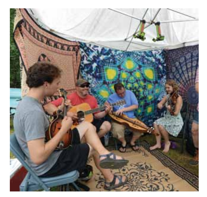
Participants at the 2016 Appalachian String Band Music Festival at Camp Washington-Carver in Fayette County.