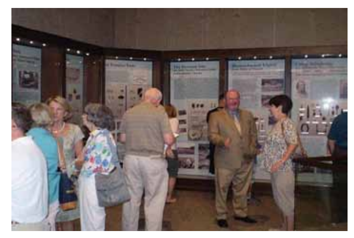
Above: The opening of the new exhibit area at Grave Creek Mound Archaeological Complex in Moundsville on July 21, 2016. Guest speaker Senator Shelley Moore Capito (left) talking with visitors.