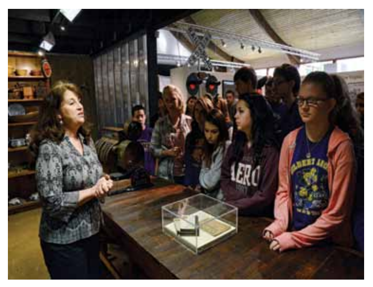
Above: Mingo County students visit the Country Store display at Museum in the Park in Logan.